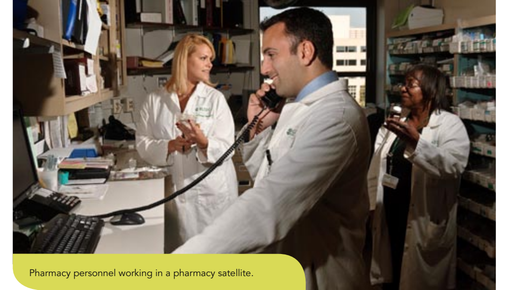
Pharmacy personnel working in a pharmacy satellite.